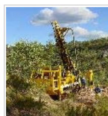
Strategic Minerals Corporation's Woolgar gold project, Qld

Click here to read the rest of today's news stories.